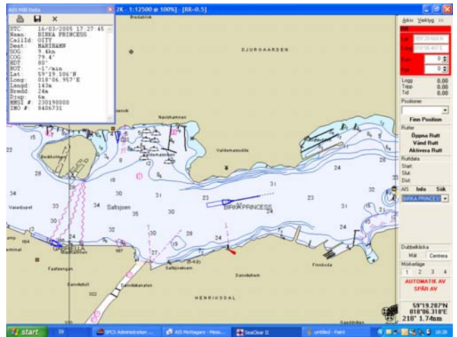
Example how AIS can be presented in a Electronic Chart System

With the AIS RX YACHT you can display any AIS equipped vessel within VHF range on any type of AIS adapted display system. Information transmitted from vessels fitted with AIS Transponders include name, call sign, position, heading, speed, destination, type and size of vessel. The AIS RX YACHT is compatible with any chart/ECS and radar system capable of accepting standard NMEA 0183 AIS sentences. The installation is quick and simple, requiring only the connection to a VHF antenna, GPS antenna and computer (PC). AIS RX YACHT is the perfect complement to a radar and has an international standardized interface to various display systems like Electronic Chart Systems (ECS) or radars.